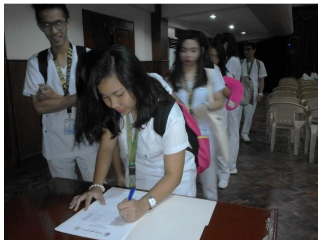
Students logged in the attendance sheet before the research seminar started at 8:00 in the morning at Performing Arts Theater.